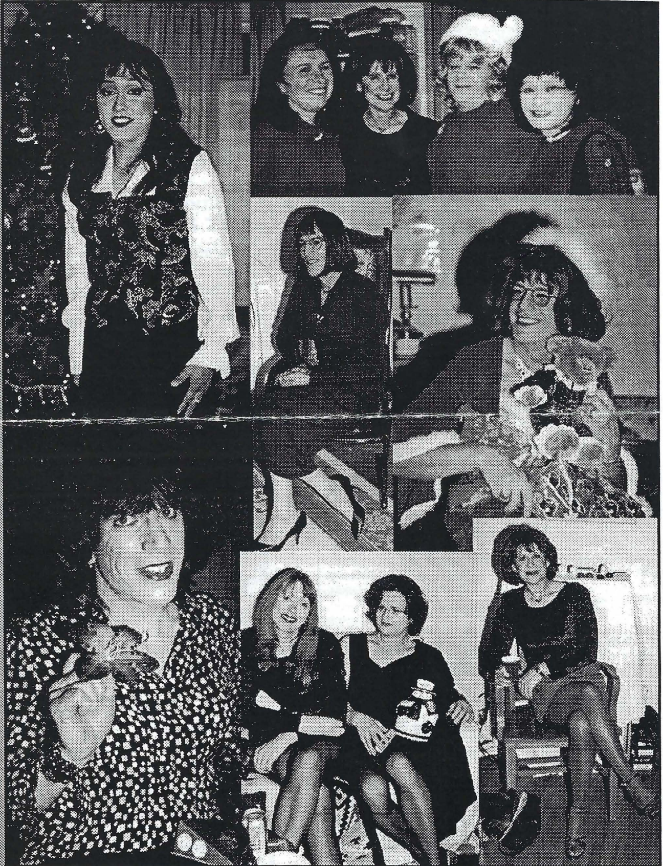
TGSF TransGender San Francisco is a group for all members of the Transgendered Community. Transgender is used as an umbrella term that includes female and male cross dressers, transvestites, drag queens or kings, female or male impersonators, intersexed individuals, pre-operative, post-operative and non-operative transsexuals, masculine females, feminine males, all persons whose perceived gender or anatomical sex may be incongruent with their gender expression, and all persons exhibiting gender characteristics and identities which are perceived to be androgynous.

TGSF TransGender San Francisco (formerly ETVC)