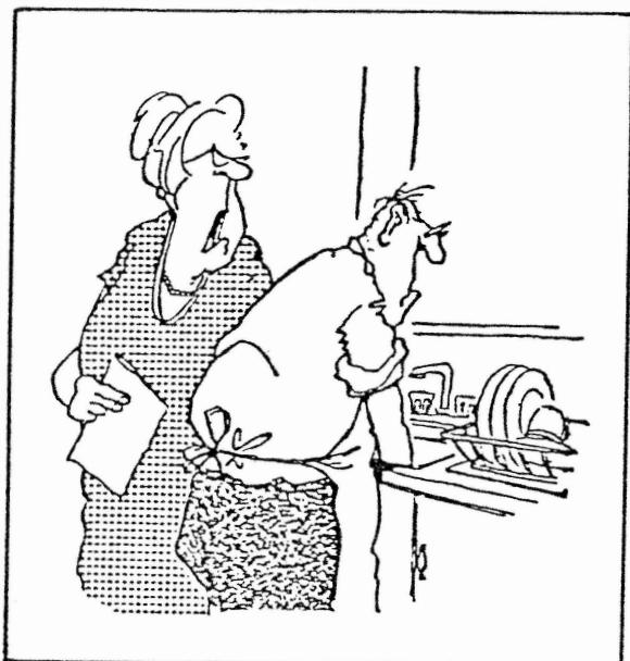
"I don't care whether or not you're 'dressed.' It's your turn to do the dishes!"

Copied, with thanks, from the "Tri-Sig News," So. California