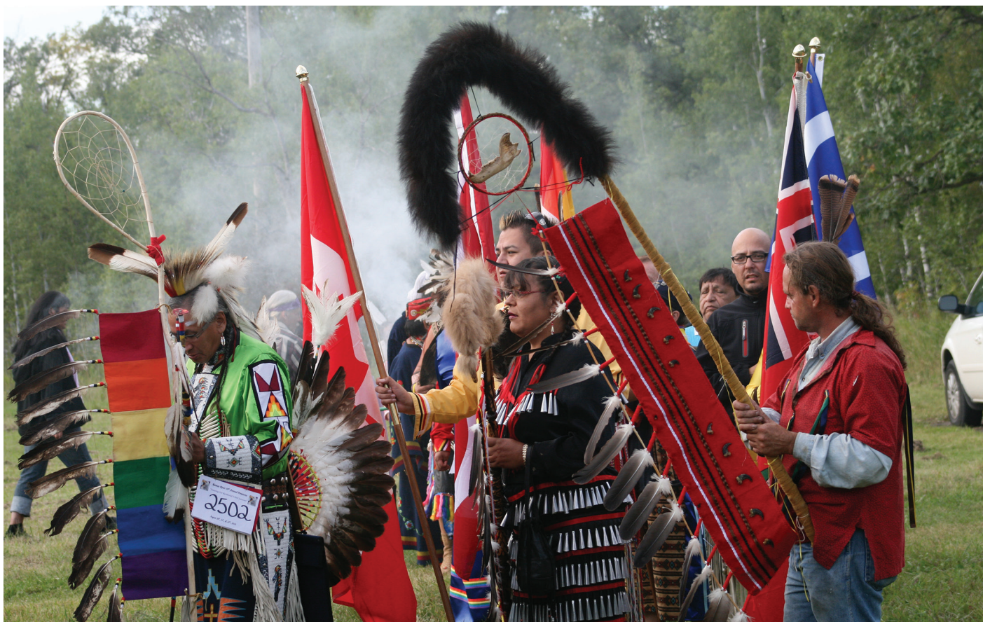
Two-Spirited Collection, box 1, folder 4-3, University of Winnipeg Archives, photo by Trevor Stratton.

The fourth series is comprised of graphic material including photographs, prints, drawings and posters. Many of the photographs depict Two-Spirited people at gatherings, likely held in either Vancouver or Manitoba. Several of the posters originate from a 2007 campaign promoting condom use among Two-Spirited people, while others advertise gatherings. The series also includes 330 digital photographs of the 22 nd Annual Two-Spirit Gathering in Winnipeg in 2010, three t-shirts and one embroidery, as well as mementos from the first Truth and