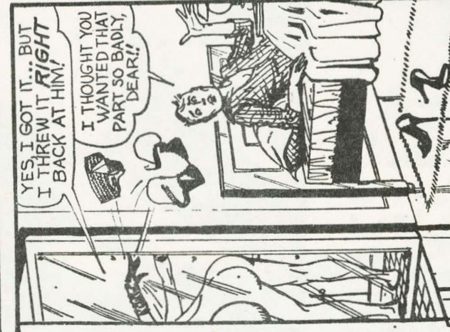
The boy/girls of "our" world - TRANSVESTIA - have a sense of humor, too! Here's a terrific comic strip that appeared in a recent issue of a TV mag. (Clipping sent in by a reader.)