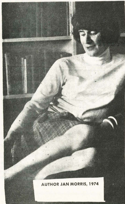
AUTHOR JAN MORRIS, 1974