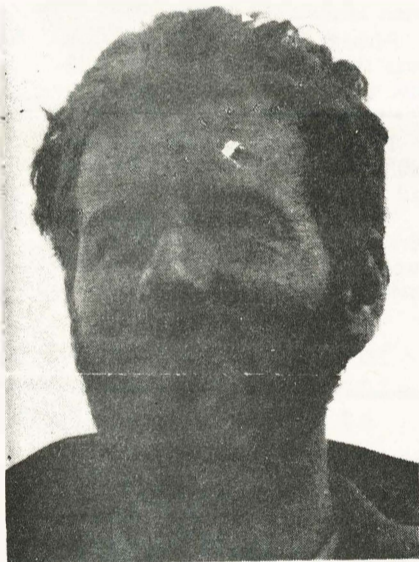
AUTHOR JAMES MORRIS, 1953

The pre-Casablanca James Morris seemed one of the least likely people on earth—possibly excepting Joe Namath—who would want to start life anew in a skirt. A brilliant writer, celebrated and comfortably off, he was the apparently happy father of four children. Morris had been an intelligence officer in a crack British cavalry regiment and a glamorous globetrotting correspondent. In 1953, for instance, he climbed 20,000 feet up Mount Everest with Sir Edmund Hillary's group and scooped the world for the Times of London