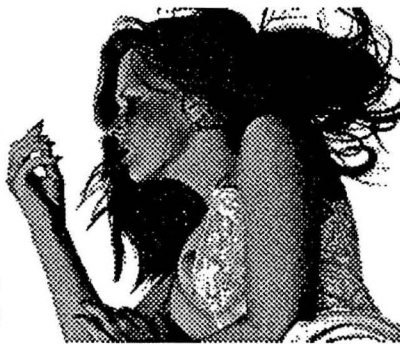
Designed just for crossdressers

Illusion breastforms are hand-made to order in four sizes; Small (32-34 A & B cup), Medium (36-38 B & C cup), Large (40-42 C & D cup) and Extra-large (44 D cup).