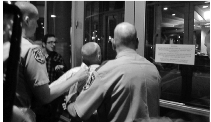
'Leslie Feinberg arrested' Minneapolis, June 4, 2012