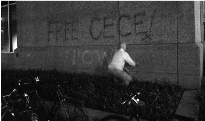
'Leslie Feinberg tagging the County Jail' Minneapolis, June 4, 2012