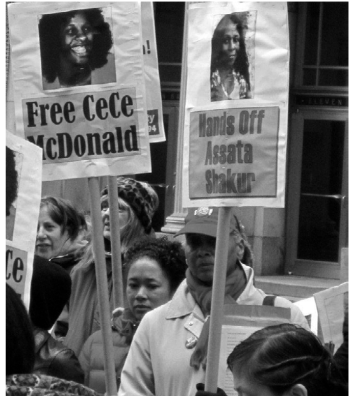
"Stop Wall Street's war on women!" Wall Street New York City March 31, 2012