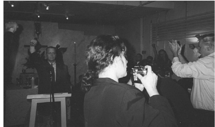
'Leslie Feinberg honoring Sylvia Rivera' 2002 Memorial, New York City

https://www.facebook.com/groups/155129424499130/