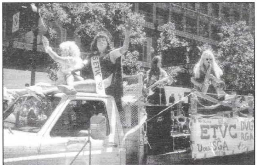
ETVC's "truck 'o' pride" at the 1997 LGBT Pride Parade