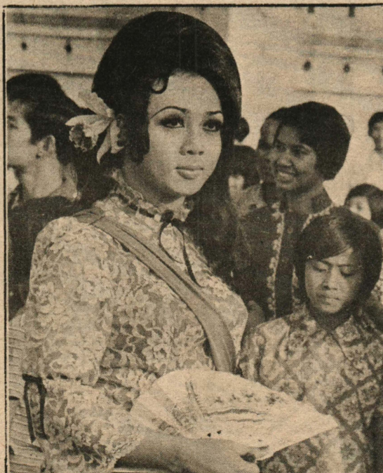
A THAI TRANSVESTITE is a real knockout.