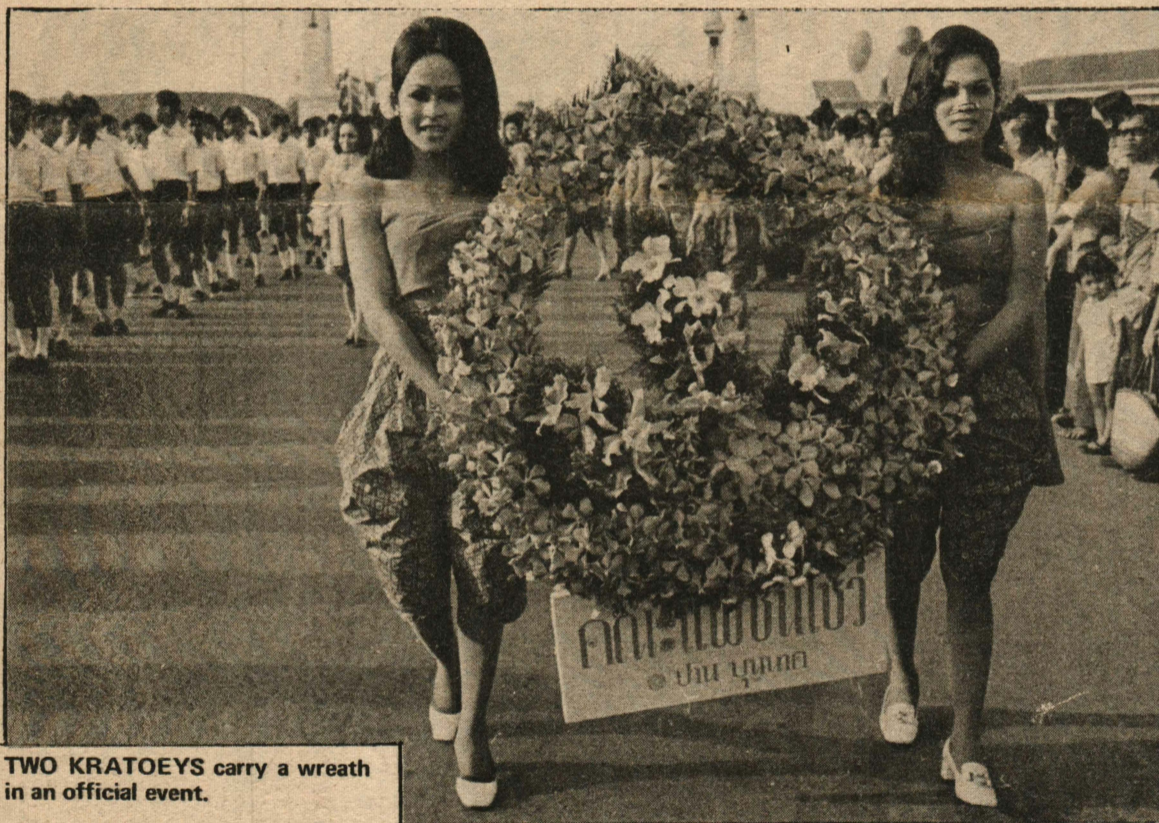
TWO KRATOEYS carry a wreath in an official event.

said. "My lover is a very nice to me and would prefer that I don't let people know what I really am."