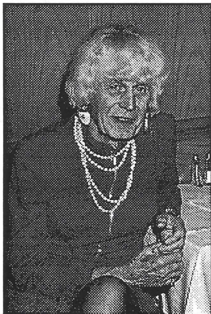
A TGSF Veteran Caught at the May Social

As you recall there were five issues on the special election ballot. The first two, which had been a subject of an earlier vote were straightforward and were incorporated into the Bylaws. The third item, the elimination of the membership year, was a bit more complicated. The third item would eliminate the concept of "the membership year", however section IV.D.1 of our Bylaws (voting eligibility) makes reference to "the membership year" and was not modified by the special election. If we were to implement the third item as is, it would result in an unworkable version of the Bylaws. As a result we cannot implement the third item until the revision has been made and voted on. Unfortunately, the discussion on the third item does not stop there. After receiving the database, the Secretary and I reviewed the work necessary to support the change in how we collect dues, and we have concluded that it is unimplementable. We have put over forty hours of work into the membership database (in a two week period), and have determined that it is approximately twelve times more difficult to maintain the membership database using the approach indicated by the third item in the special election.