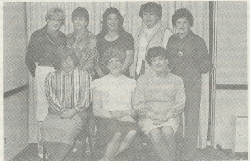
Chi - Delta - Mu

Few transvestites are fortunate enough to have a wife who "understands" and cooperates with her Tv husband. These wives are called "A" wives and often help their husbands choose proper clothing. They also often accompany their Tv husbands on trips involving shopping and dinner. Unfortunately for the vast majority of Tv's, most wives fall in the category of "C", "D", and "E" wives. This often means that the husband has to hide or repress his dressing activities.