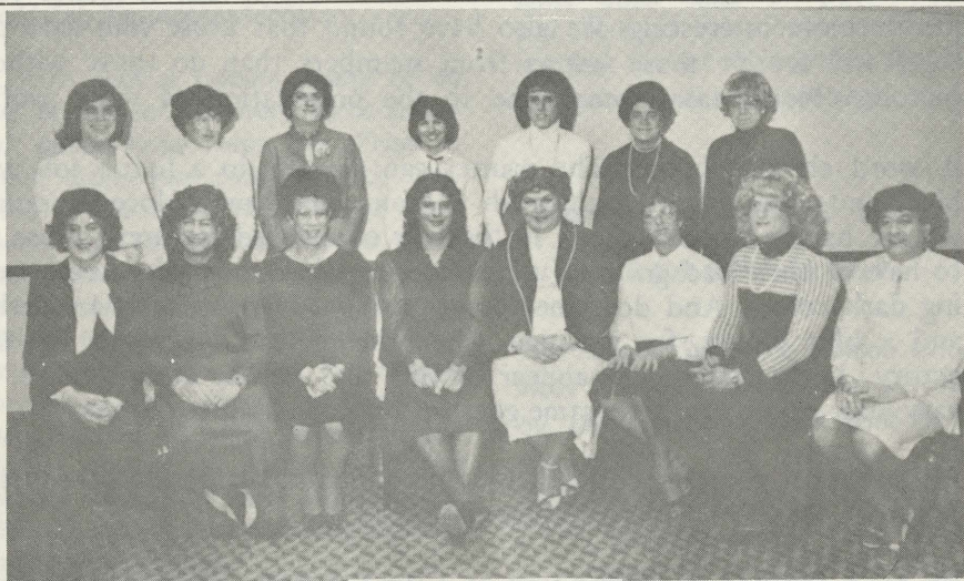
Chi - Delta - Mu

WHAT IS IT? WHOM IS IT FOR? WHAT ARE ITS GOALS?