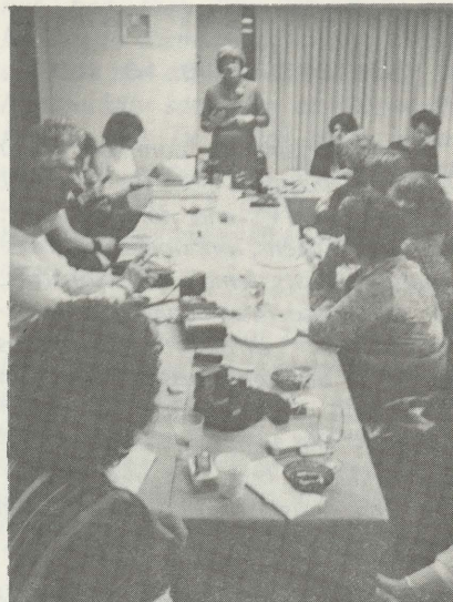
The Girls Of Chi - Delta - Mu

Many people are indeed surprised to find that Tv's aren't looking for sex like the drag queens, or for a living, like the drag prostitutes and female impersonators. Many gay people are surprised that heterosexual Tv's exist at all! In fact, to the vicarious thrill seeker, real Tvism probably appears shockingly boring.