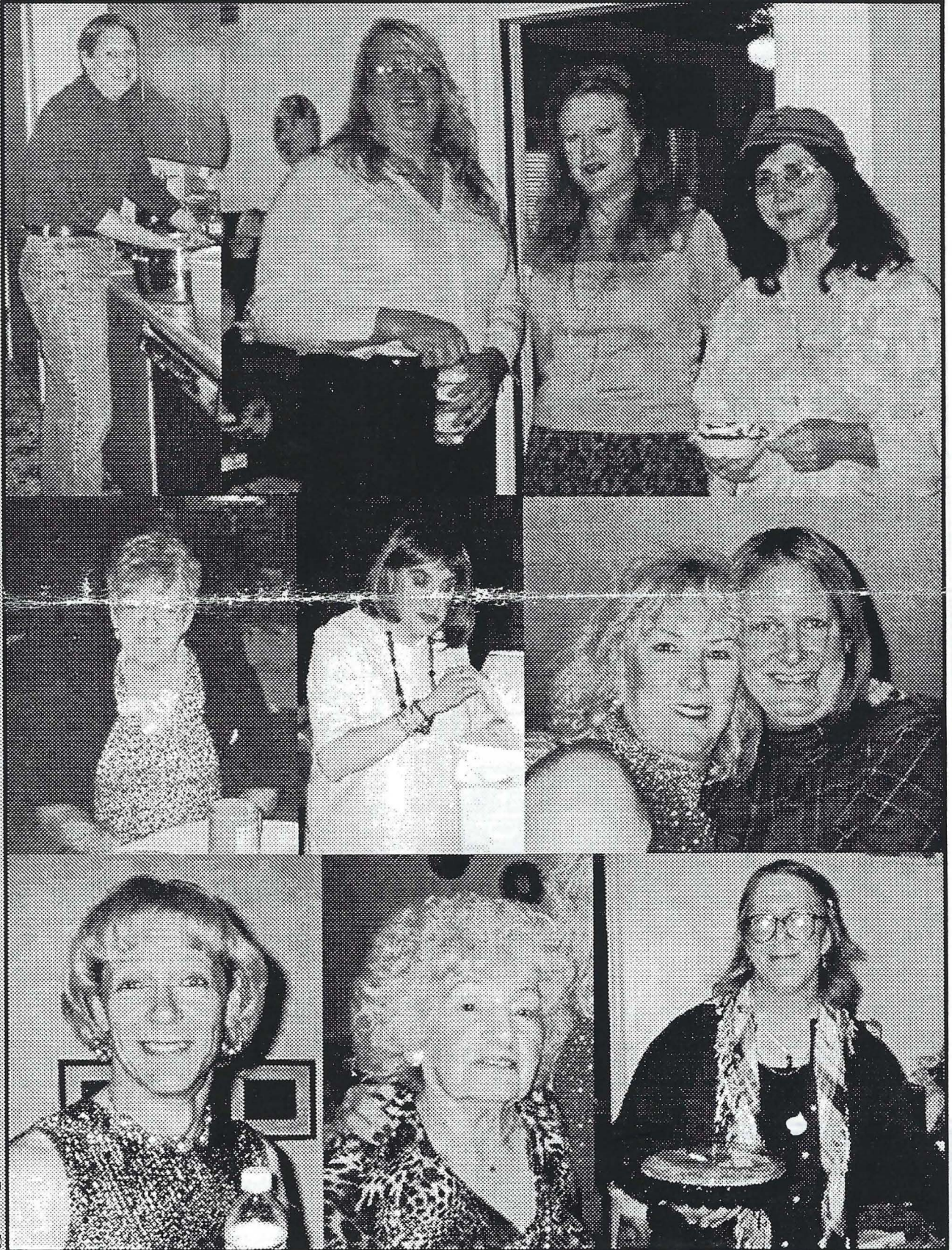
TGSF TransGender San Francisco is a group for all members of the Transgendered Community. Transgender is used as an umbrella term that includes female and male cross dressers, transvestites, drag queens or kings, female or male impersonators, intersexed individuals, pre-operative, post-operative and non-operative transsexuals, masculine females, feminine males, all persons whose perceived gender or anatomical sex may be incongruent with their gender expression, and all persons exhibiting gender characteristics and identities which are perceived to be androgynous.

The Channel TGSF Trans Gender San Francisco