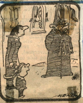
I always thought they were women