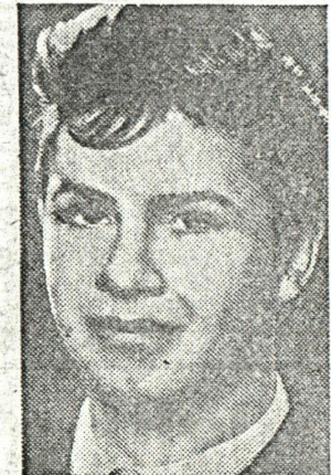
APRIL ASHLEY as a boy of 16

On the other hand, it was common ground that before the marriage ceremony, nearly three years