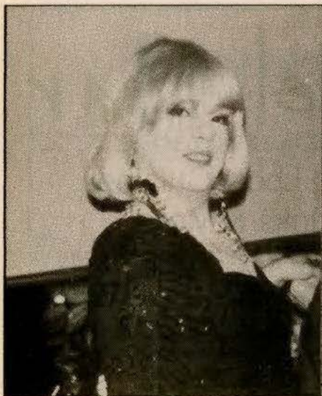
A look that says, "I'm a winner!"