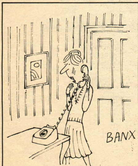
"For God's sake, George, do be careful today—you left your Kidney Donor card in your gardening jacket."